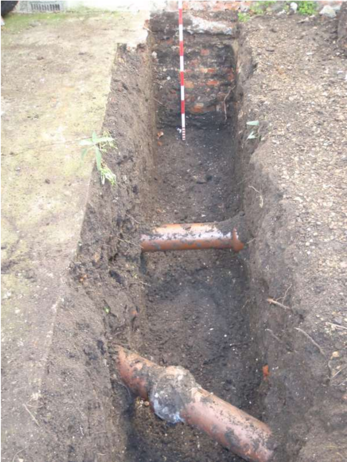
Plate 3. View of foundations (looking S)