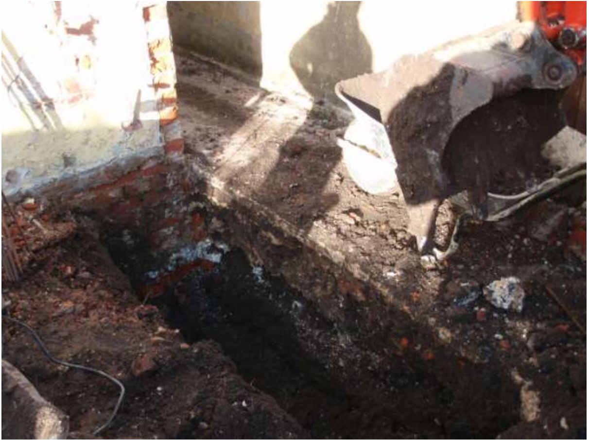
Plate 4. View of drainage run (looking S)