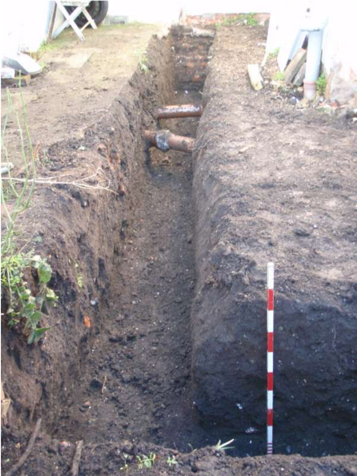
Plate 2. General view of foundation trenches (looking E)