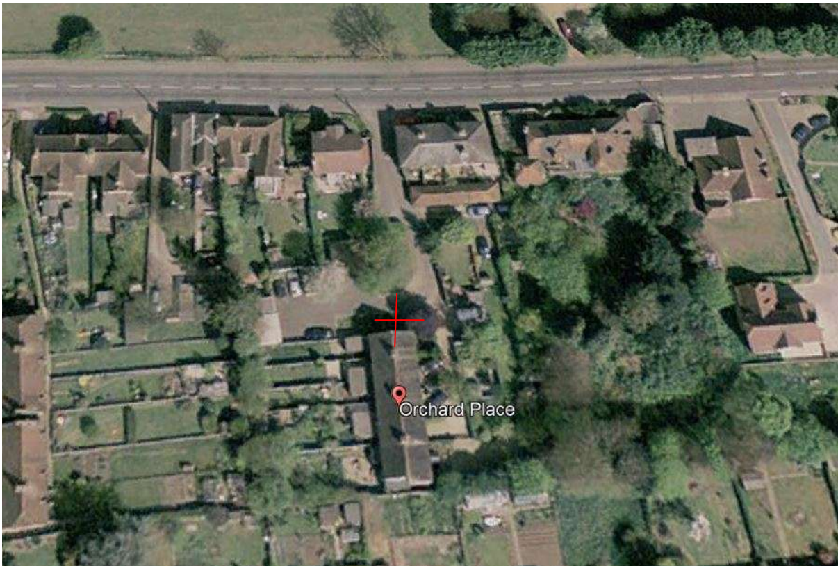
Plate 1. Aerial view of site (red target) showing the site prior to development.

(Google Earth 20/4/2007: Eye altitude 317m).