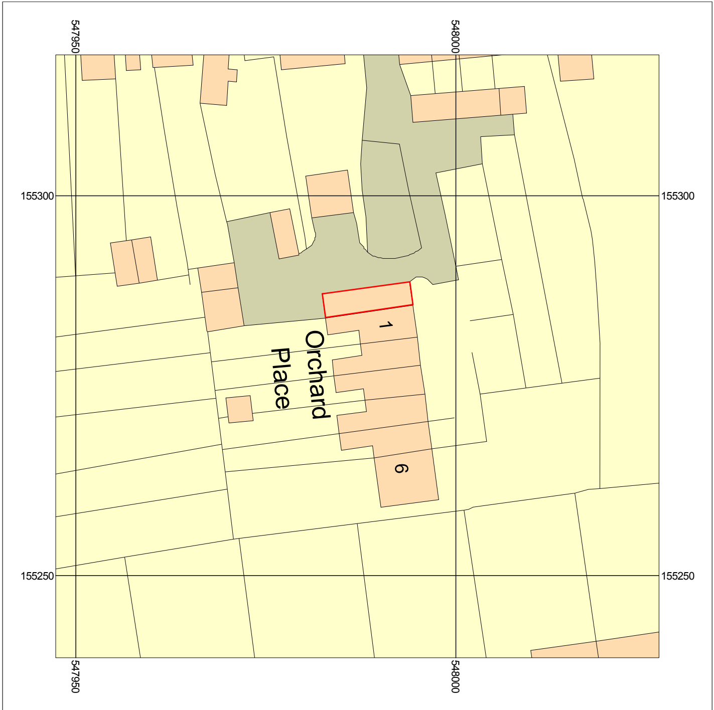
Figure 1. Location of area watched (red line)